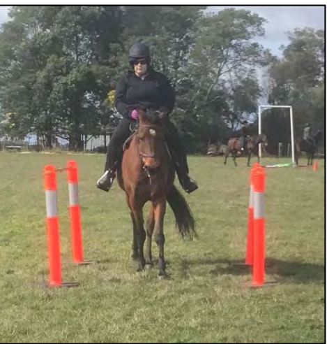
NARC Newsletter September 2018